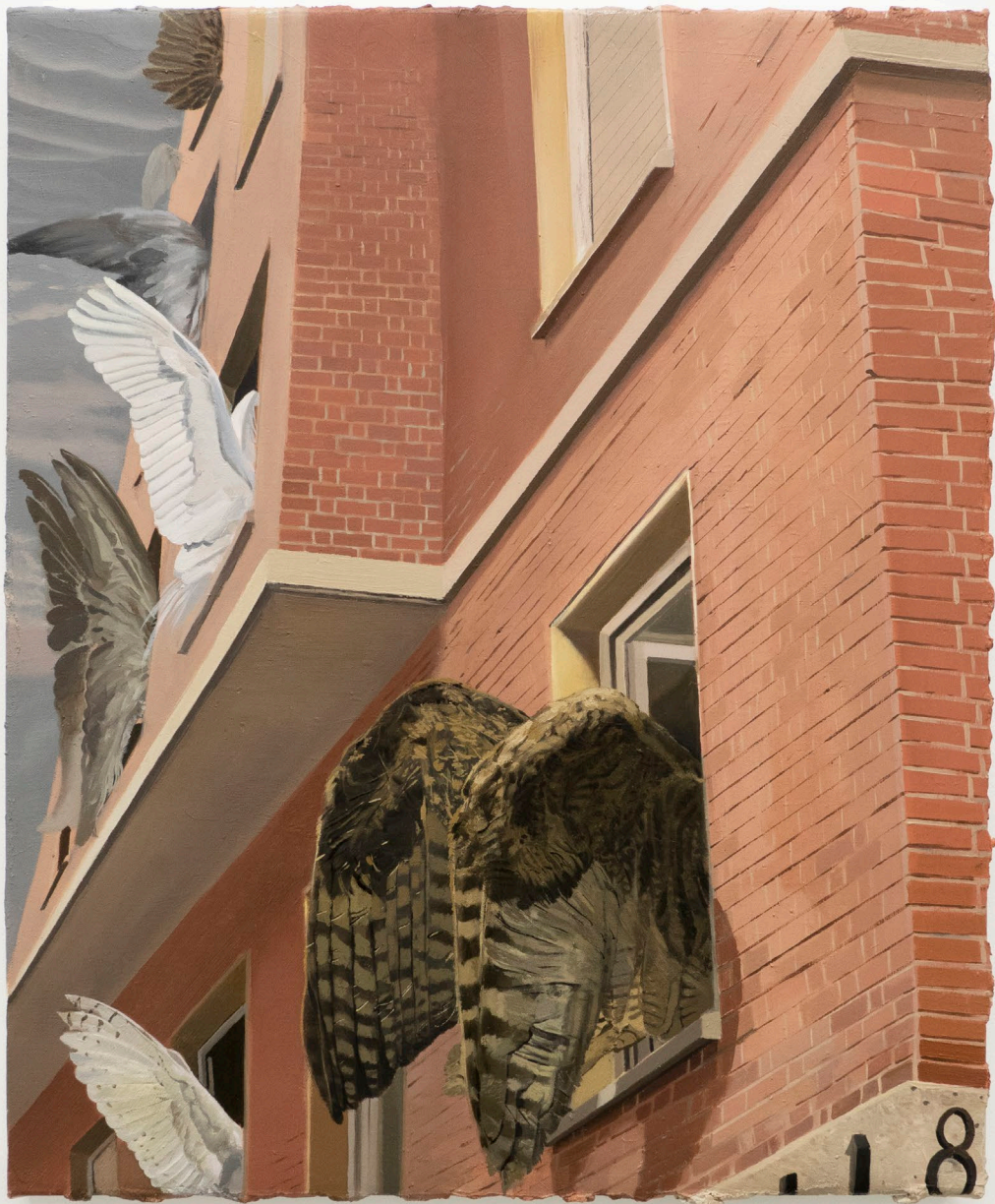
Ogino Knaus, 2022 Oil on linen 56 x 46 cm