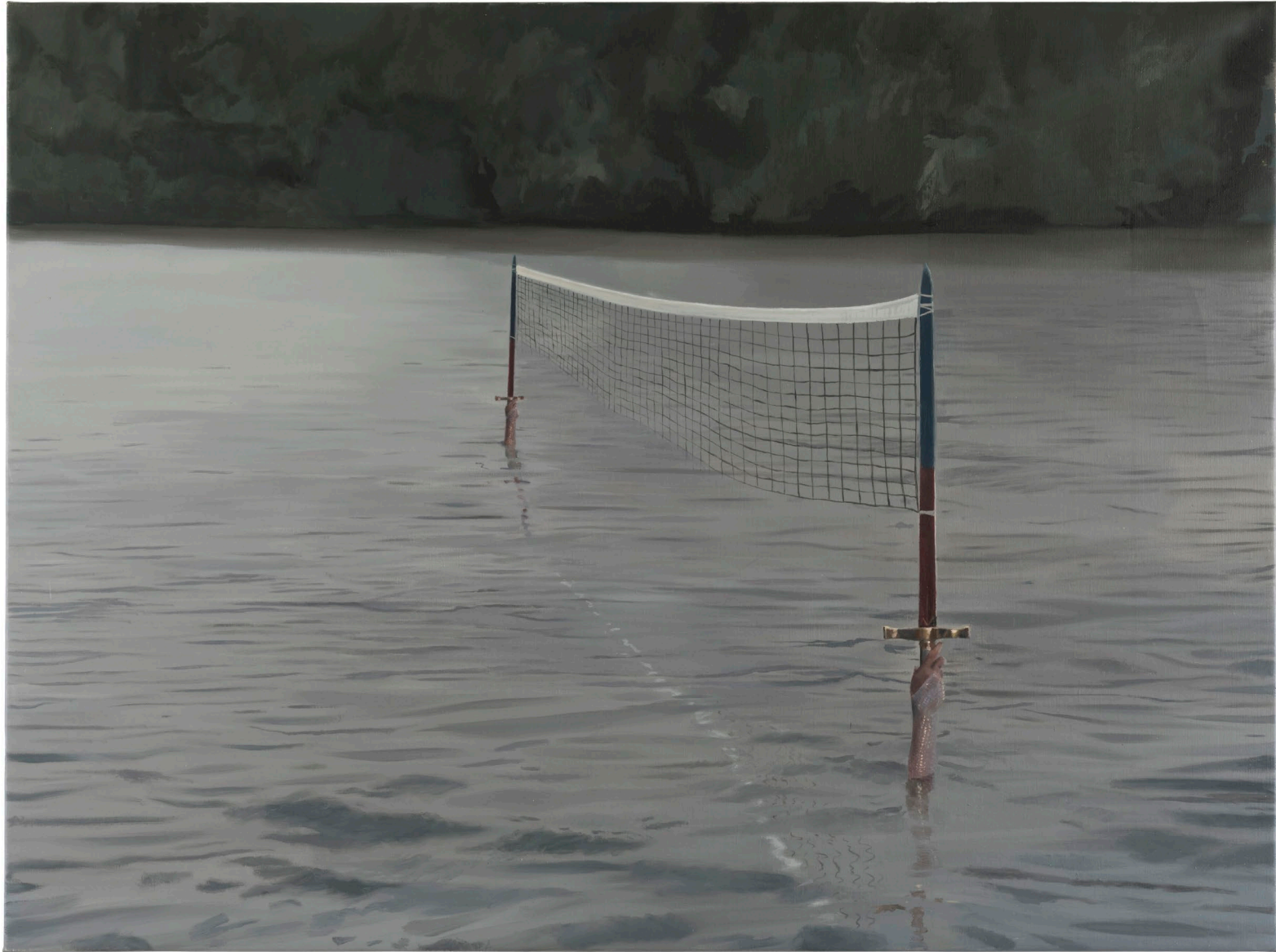
Double Excalibur, 2019 Oil on linen 97 x 130 cm