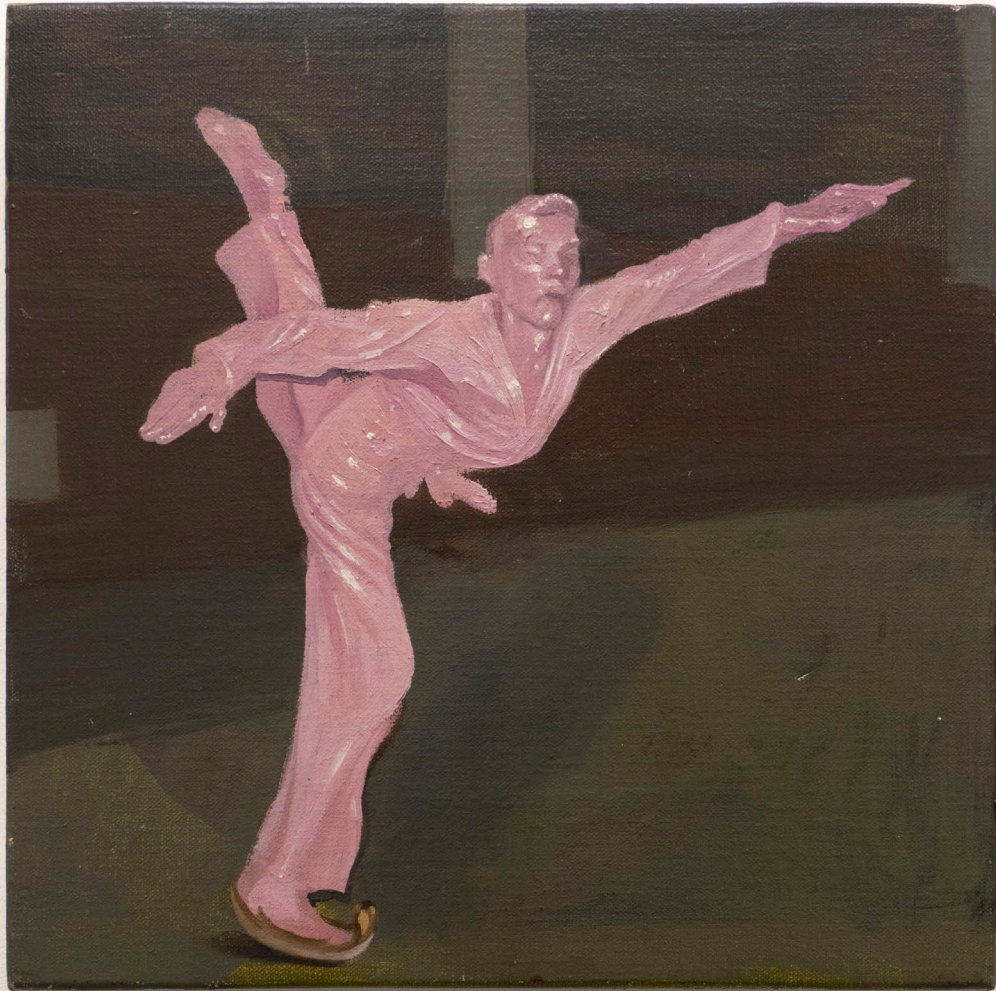
S/T, (dancer), 2014 Oil on linen 30 x 30 cm