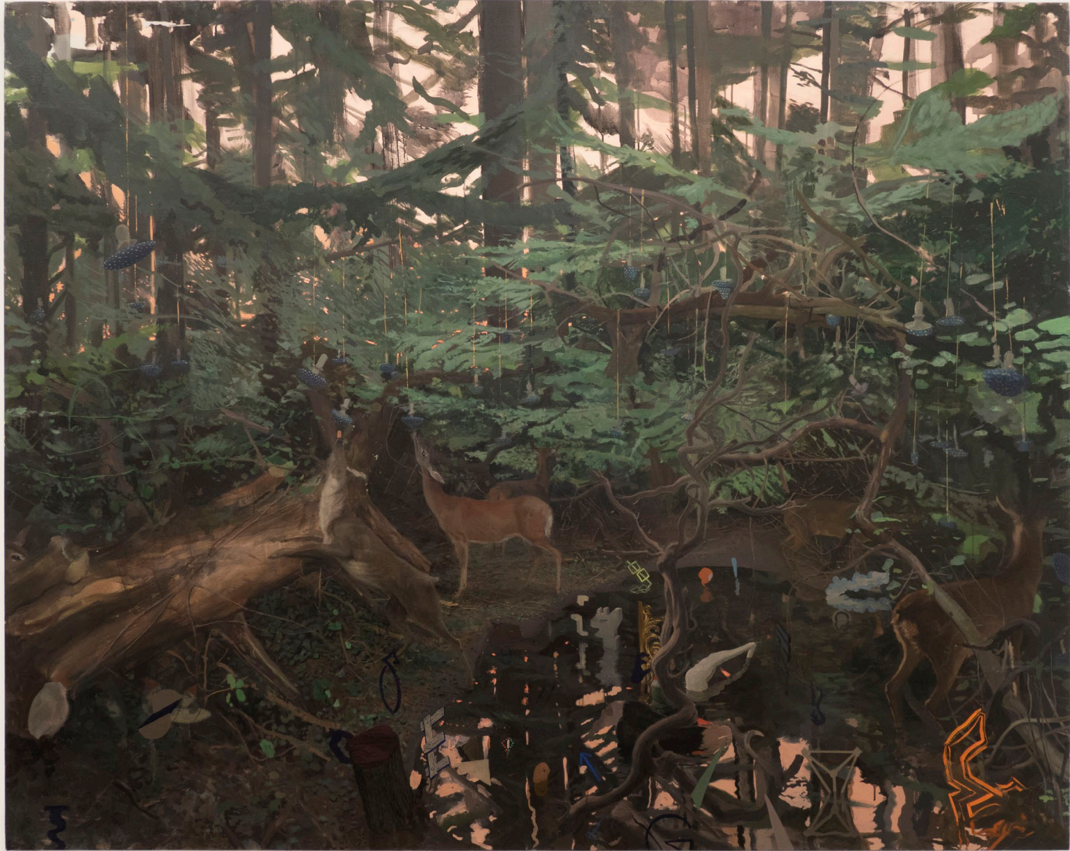
S/T, 2022 Oil on linen 160 x 200 cm