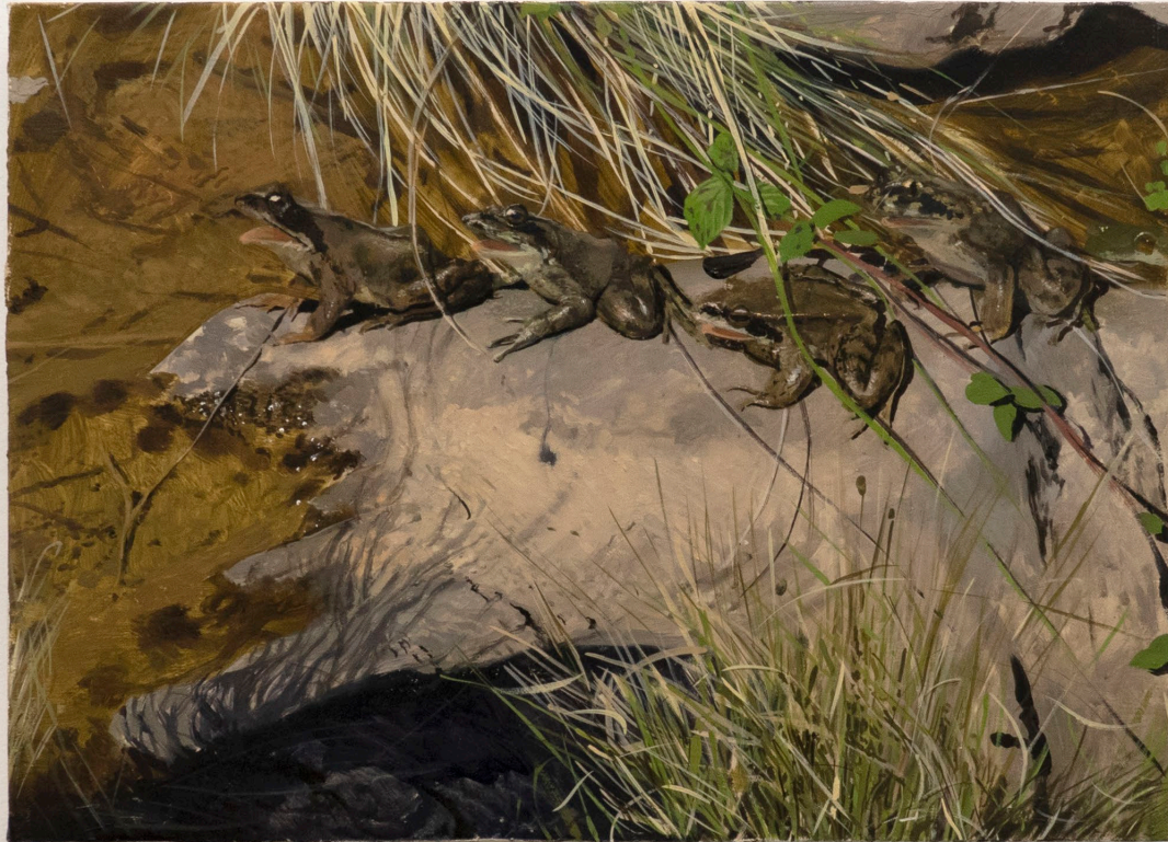
Five frogs singing along, 2022 Oil on linen 33 x 46 cm