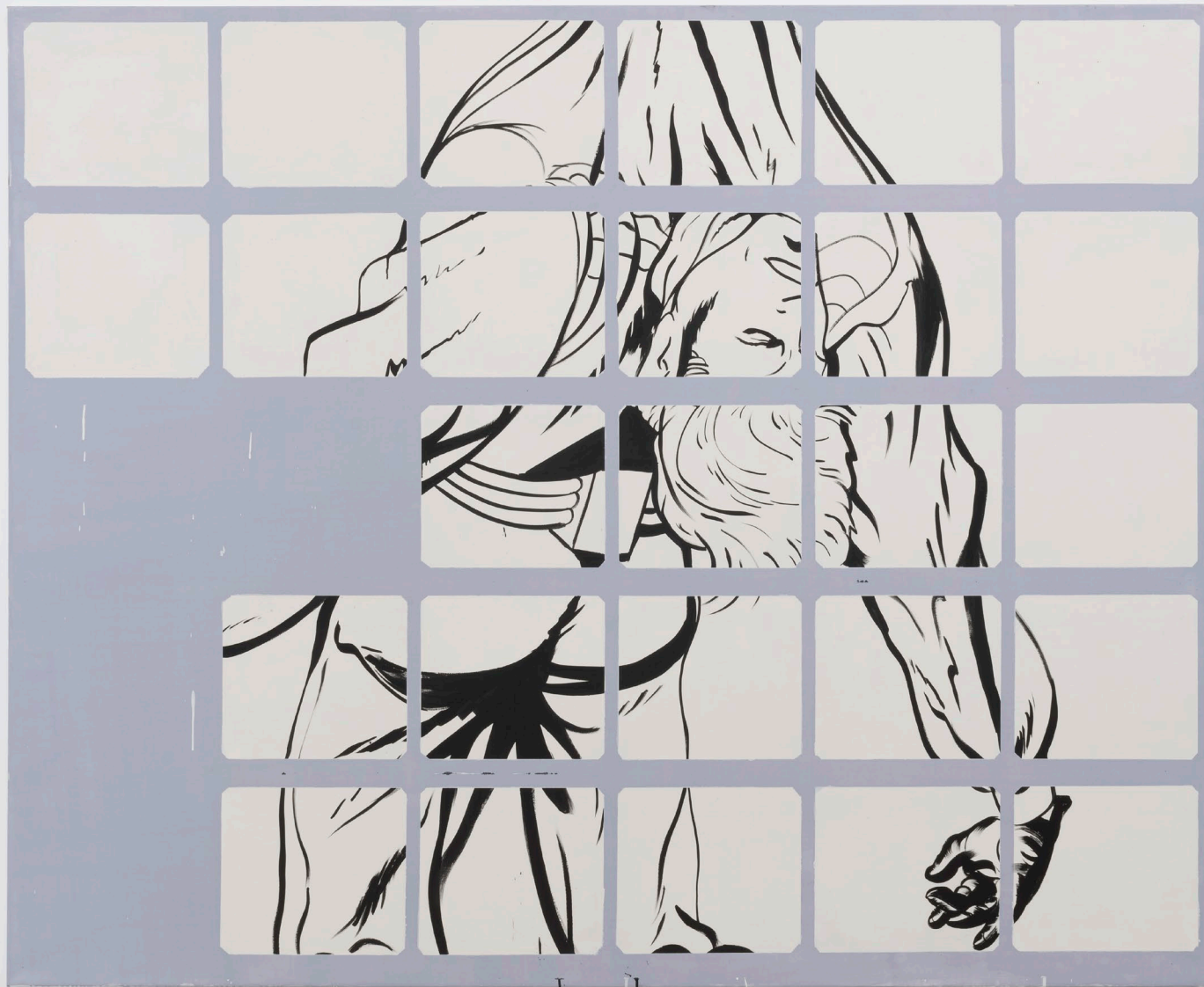
S/T, 2022 Oil on linen 200 x 250 cm