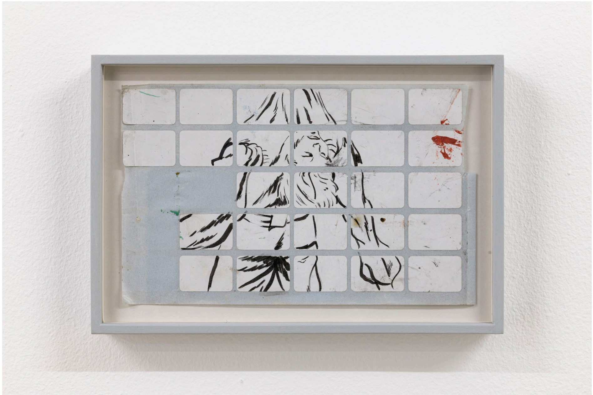
S/T, 2022 Ink on price tags 14 x 20,5 cm