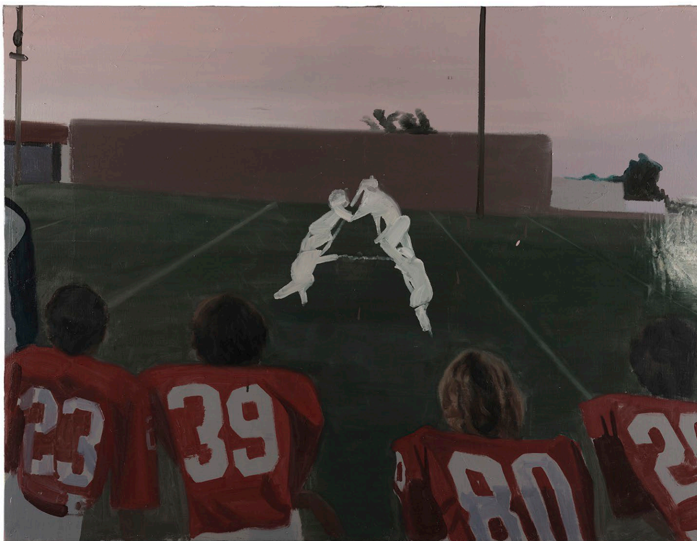
S/T, 2022 Oil on linen 47 x 55 cm